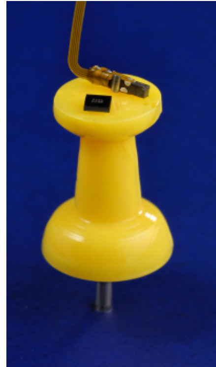
UTAF motor and driver

>> Learn more about the UTAF motor, technology and modules